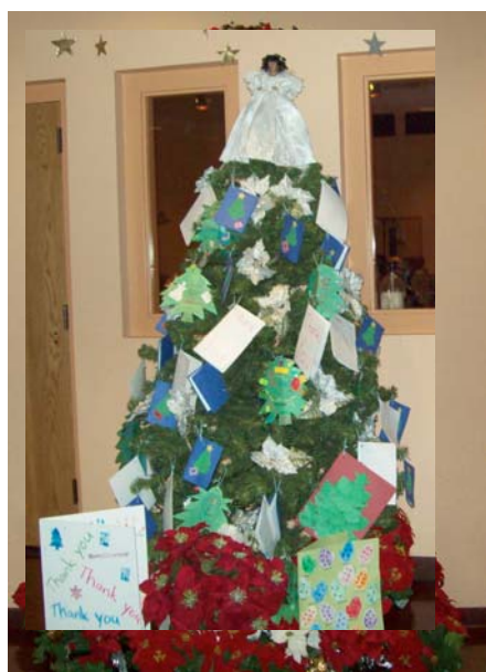
Angel Tree with Thank You's

An "Angel Tree" was also part of the Outreach program for Christmas. On December 16, 2010 the Outreach Committee delivered over 160 Angel tree gifts to the Kindergarten and First Graders of the Charles West Preparatory School. The Parish received wonderful thank you notes from these children. Thanks to the St. James Community for their donations, and to the Confirmation students for wrapping all the gifts.