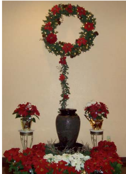
Church Lobby at Christmas

sight for the Christmas season. The many manpower hours were used for hanging of the beautiful 'wreaths' and garland; setting-up the Christmas trees; dusting poinsettia plants; setting up the Nativity Scene; arranging the star studded lobby; decorating the holy water font; shopping for additional decorations; cash donations, and the many, many beautiful poinsettias, etc., etc.